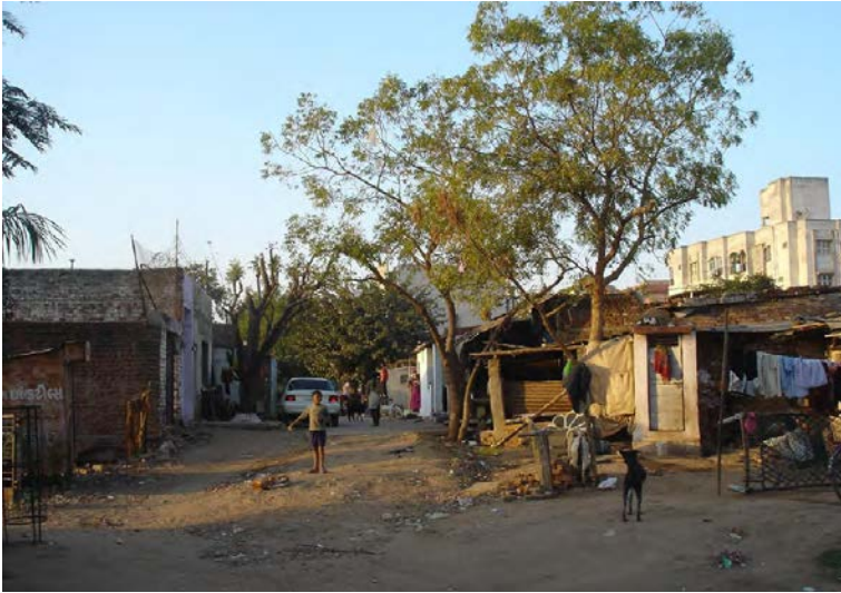
Figure 2b. Neighborhood after Upgrading